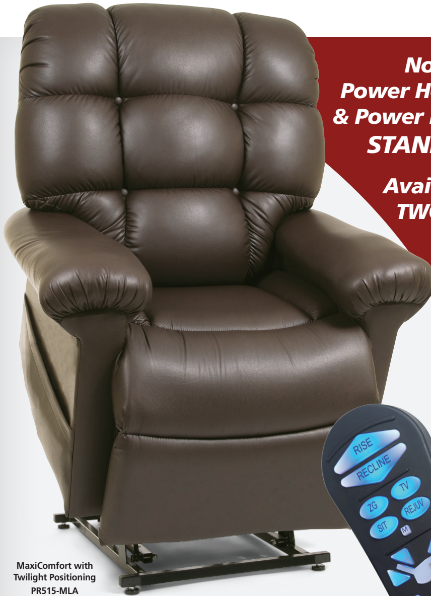
MaxiComfort with Twilight Positioning PR515-MLA

Now with Power Headrest & Power Lumbar STANDARD!